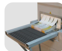
Optional exit conveyor